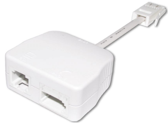
Z-350UK filter provides a DSL convenience jack for connecting a DSL modem